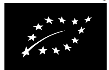
Permitted black and white