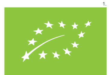
Pantone 376 | C050:M000:Y100:K000